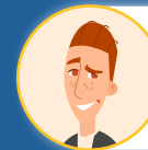
Baxtar, 14, all-rounder